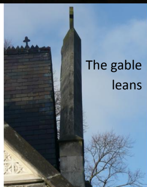
The gable leans