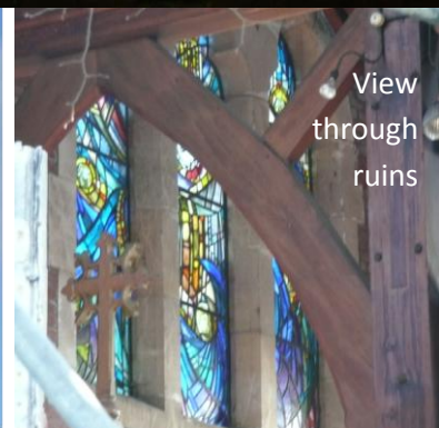
View through ruins