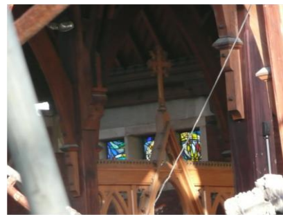
Some of the smaller windows